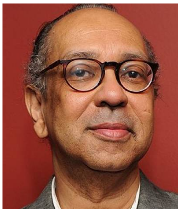
GEORGE C. WOLFE

The play has received overwhelming critical praise for its provocative subject matter and in-depth exploration of the African American theatrical and cultural past. The Colored Museum has been performed all over the world; in New York, New Jersey, and, most famously at the Royal Court Theater in London. The initial cast featured prominent TV and movie actress Loretta Devine and was directed by L. Kenneth Richardson. The Colored Museum has electrified, discomforted, and delighted audiences of all colors, and played a pivotal role in defining our ideas of what it means to be Black in America today.